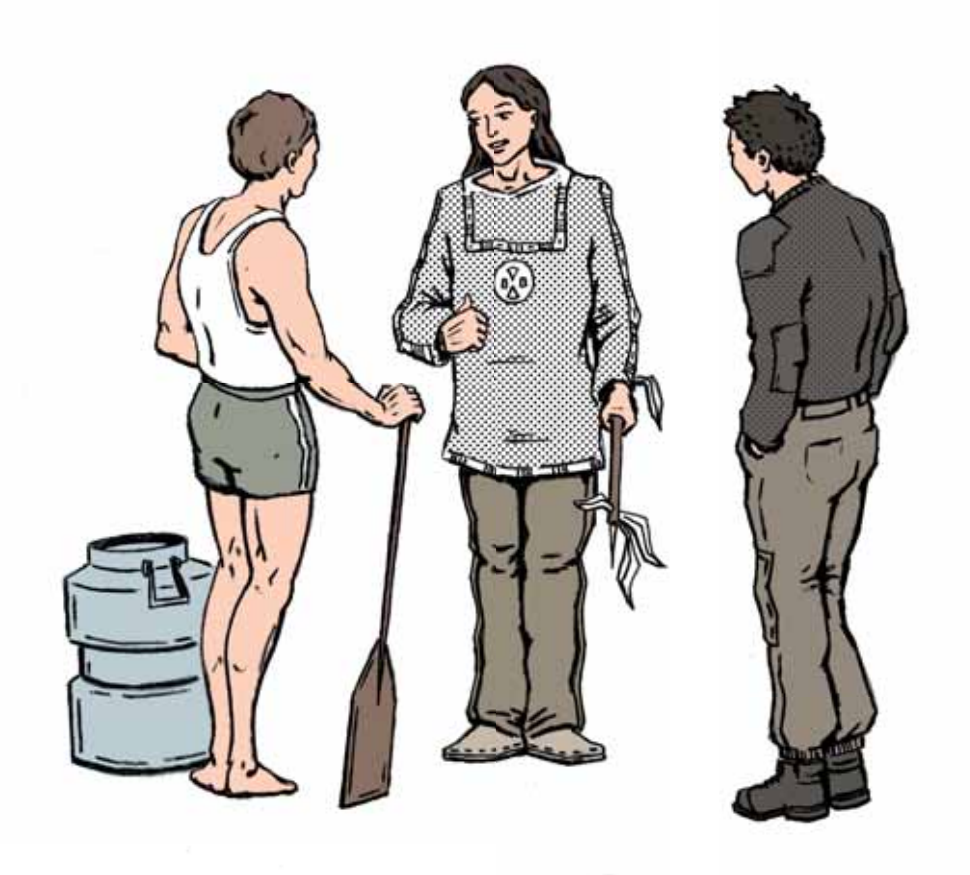
Vydala Česká rada dětí a mládeže