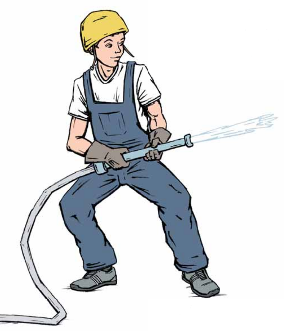
PART I - WHO FORMS ČRDM AND WHY

In 2008 the Council associated 94 member organizations, including seven Regional Councils of Children & Youth. The ČRDM was joined by the Council of Children and Youth of Prague, the Capital City and by the Velký vůz association. At the same time three associations lost their membership.